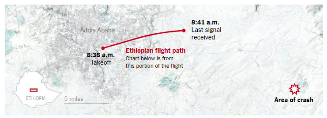
By Scott Reinhard

85. On March 10, 2019, Flight 302 took off from Addis Ababa towards its destination of Nairobi, Kenya. Within one minute of its departure, the pilot calmly radioed that he was having flight control problems. Within three minutes, now panicked, the pilot requested permission to return back to Addis Ababa. The plane was accelerating abnormally and oscillating up and down. Shortly thereafter, all communication with Flight 302 stopped and the plane violently crashed into a field, killing all 157 people aboard, including DECEDENT .