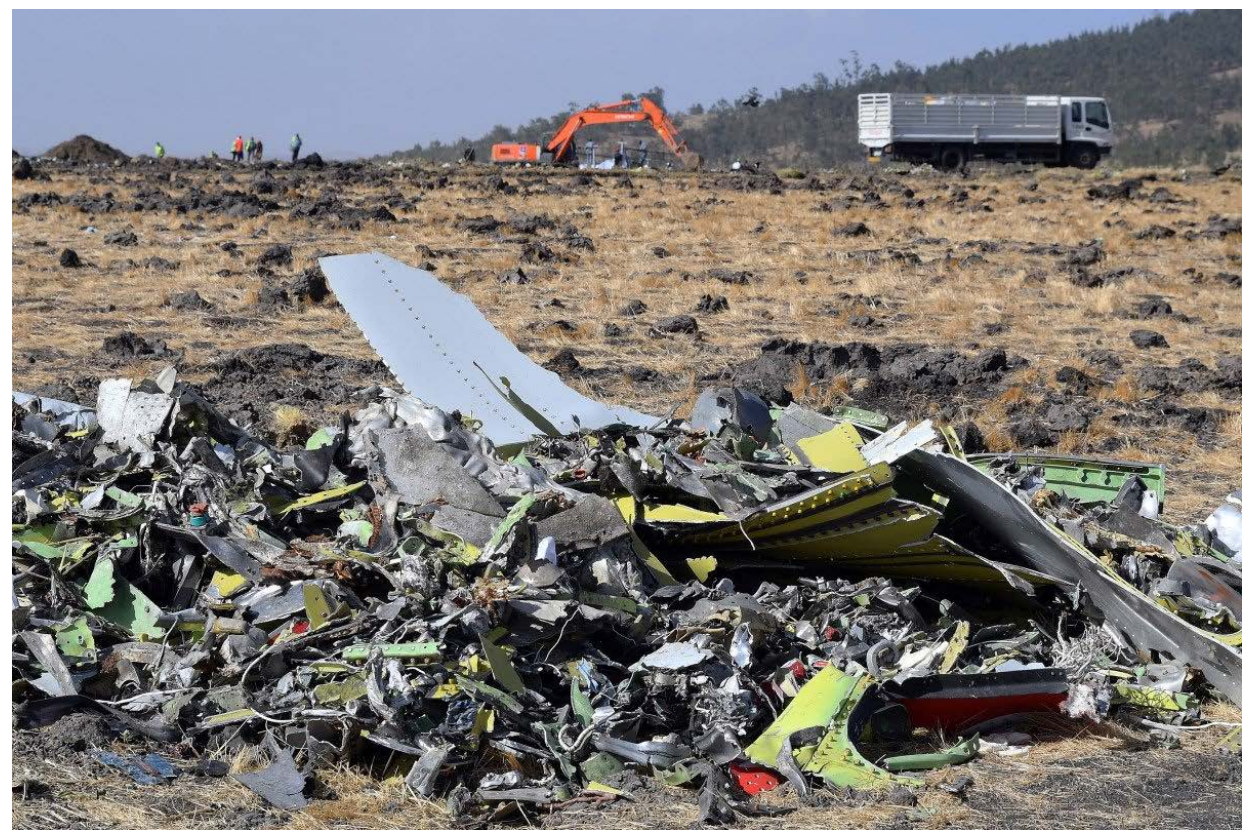
The Wreckage of Ethiopian Airlines Flight 302

Case: 1:19-cv-02849 Document #: 1 Filed: 04/29/19 Page 5 of 52 PageID #:5