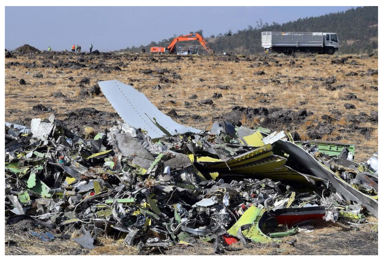
The Wreckage of Ethiopian Airlines Flight 302

Case: 1:19-cv-02841 Document #: 1 Filed: 04/29/19 Page 5 of 51 PageID #:5